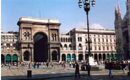
Galleria Vittorio Emanuele