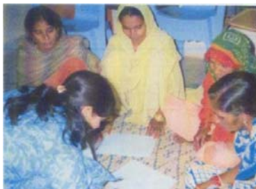
Literacy class at Chatterpur village near Delhi (NADA-sponsored)

Chattepur where foreign volunteers can stay. Presently 2 students from the U.S. are staying there. Donations are needed for continued support of NADA-India. Email: vsuneel40@yahoo.com